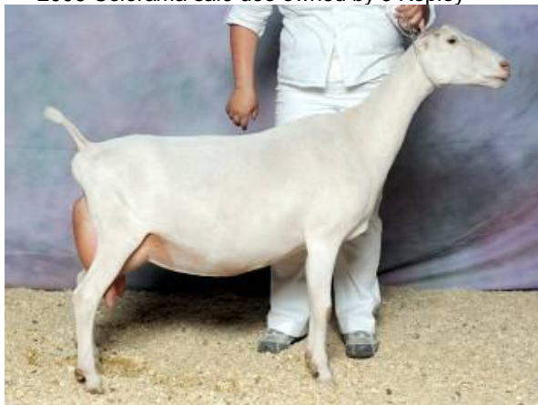
SGCH Barnowl Hockus Pockus (owned by Barnowl) 2008 ADGA NATIONAL 1 st /1 st udder 2 yr old 3-04 FS91 VEVE

Not pictured- CH Tempo Kelly FS91 VEEE and 2006 Colorama sale doe owned by J Koploy