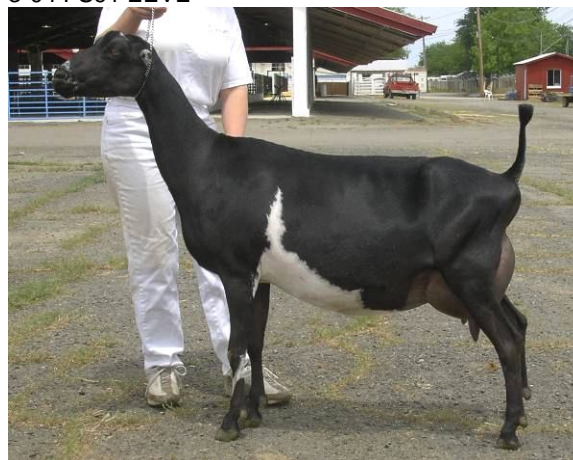
Tempo Dawn 3*M (deceased) LA 1-7 FS87 +EVE '10 1xGCH, 7xRSGCH, 10x1st in 12 shows