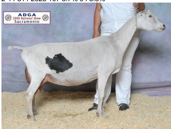
CH Barnowl Acythera (owned by Barnowl) 3-02 FS91 EEEE

Barnowl Abracadabra *M FS90 VEVE 2007 Spotlight Sale Doe owned by Purple Thistle