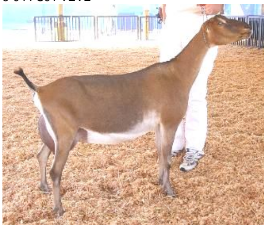
SGCH Tempo Killy 5*M (owned by Redland 2-5 FS90 EEEE Community College) 2-11 311 2925 107 3.7% 94 3.3%