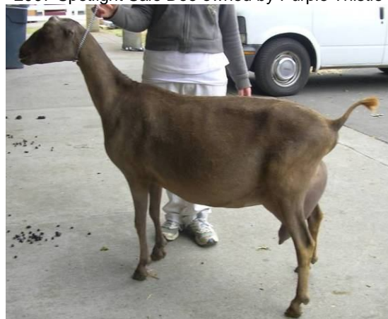
SG Tempo Jerin 3*M (owned by S. Bensen) 3-04 FS91 EEVE

Barnowl Abracadabra *M FS90 VEVE 2007 Spotlight Sale Doe owned by Purple Thistle