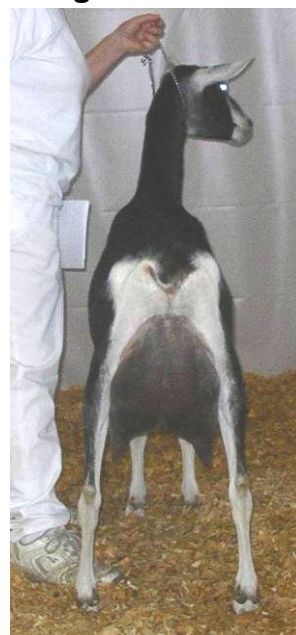
Tempa Aquila Roseti, 1 st /1 st udder milking yearling, 2013 Washington State Fair (maternal sister to Danziger)