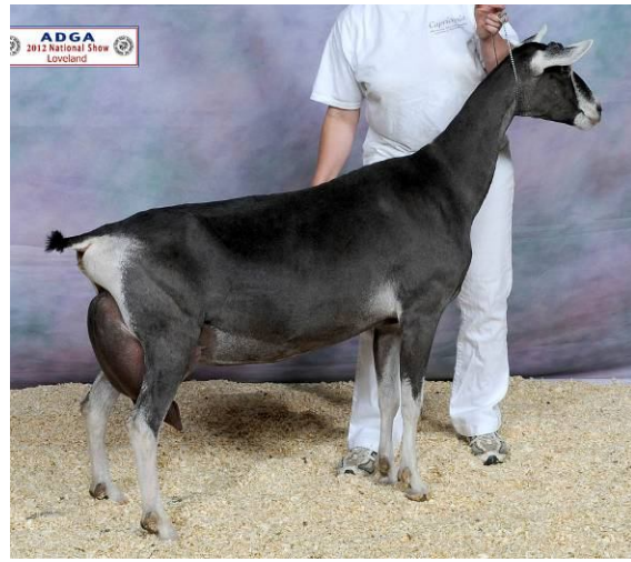
SGCH TEMPO AQUILA ABSINTHE 6*M 3-4 FS92 EEEE 6xGCH, 2xBQB, 1xBIS 2-02 305 3625 123 3.4% 99 2.7%, ext 482 5261 184 148 2013 ADGA National Show 3 rd place 3 yr old