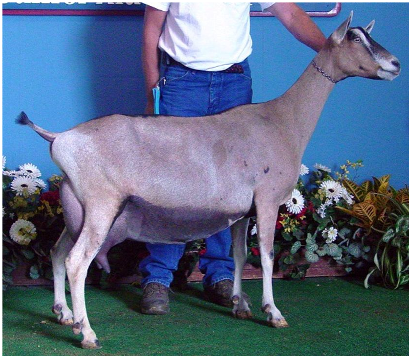
SGCH COMPANEROS SEQUOIA JAZZ 9*M 6-6 FS91 VEEE 1-01 305 3210 143 4.5% 86 2.7% TOP TEN Lifetime 2582 21610 828 3.8% 615 2.8%