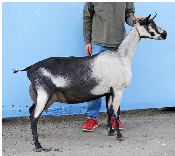
SG REDWOOD HILLS JAZZ ZUNI 10*M 2-04 88 EVVE (1 st freshener) 1-10 305 2770 96 3.5% 82 3.0%