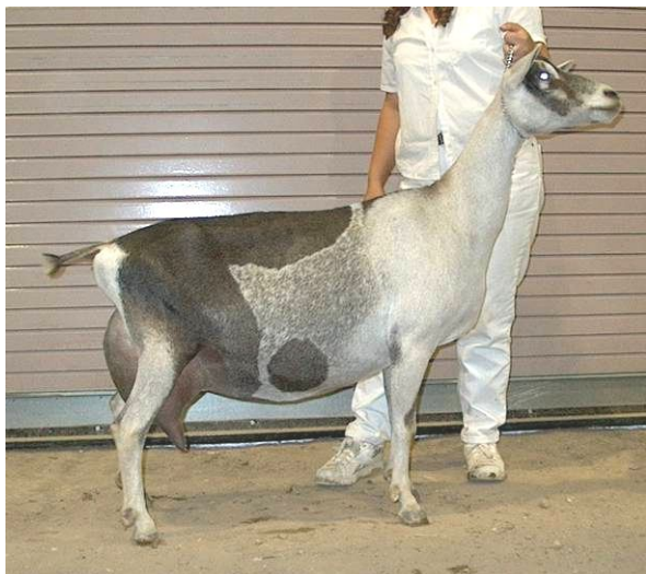
GCH TEMPO WHITE MACAROON 3*M

Macaroon is the dam of Tetra, and also the dam of Praline. Both Macaroon and Praline were bred to Royal Image, producing \frac{3}{4} sisters, Tetra and Tokay. Royal Image was also the sire of the twins Freely Imagined and Freelance, and at least one other FS92 doe, Feelin' Free. Feelin' had two GCH legs when she was injured as a young doe and not shown again. As a side note, she was the granddam of Living Free.