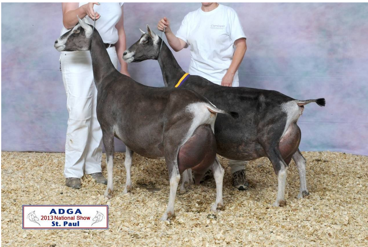
Tetra (back) and Rotini (front) 1 st place dam & daughter