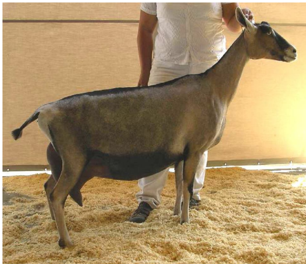
SGCH TEMPO AQUILA DANCIN' FREE 3-5 FS92 EEEV 3xGCH, 1xBIS 2-11 305 3394 112 3.3% 95 2.8%