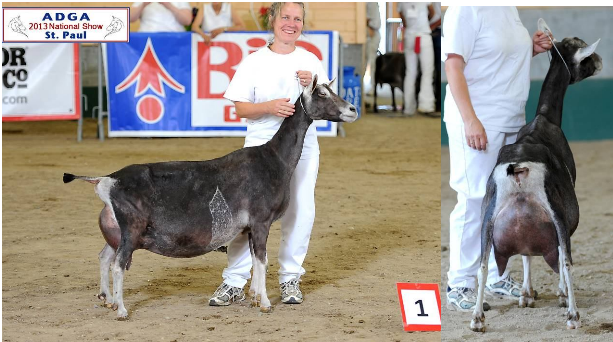
Tetra, 1 st place aged doe at 9 years old, just before winning National Champion