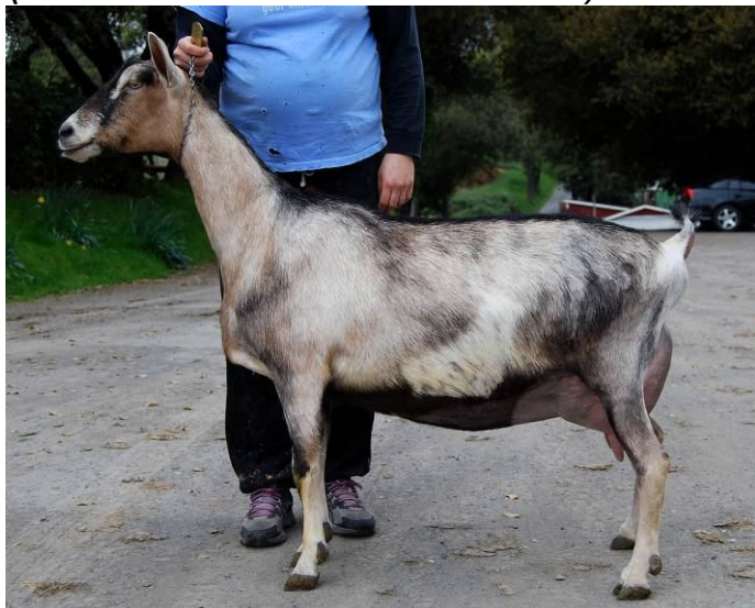
SGCH REDWOOD HILLS TRIBUTE RIANNA 12*M 02-05 89 EEEE (1 st freshener) 1-11 302 2660 113 4.2% 66 2.5% '13 REDGA Spring Show- GCH, BOB, BIS