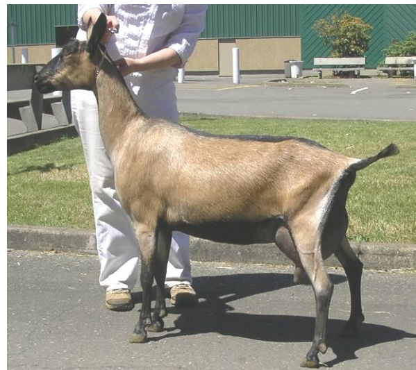
SG TEMPO AQUILA FREE SPINDLE 6*M 3-4 FS90 VEVE 1-05 305 3037 92 3.0% 82 2.7%, ext 455 4455 138 123