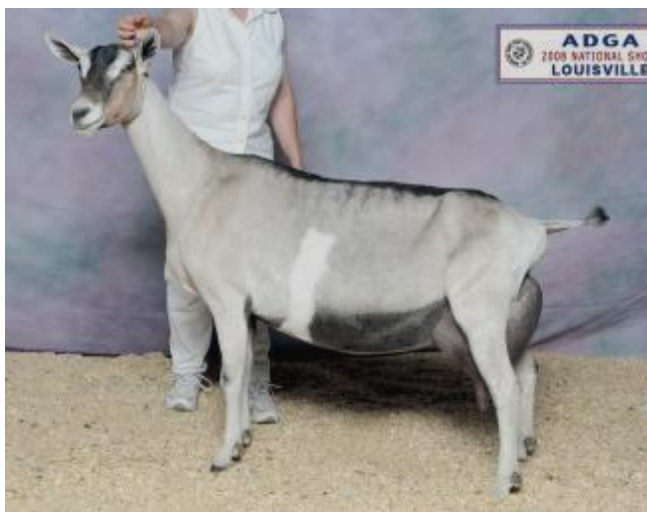
SGCH TEMPO AQUILA TOKAY 5*M

2005 Nationals 1 st Dam & Daughter w/ Tokay