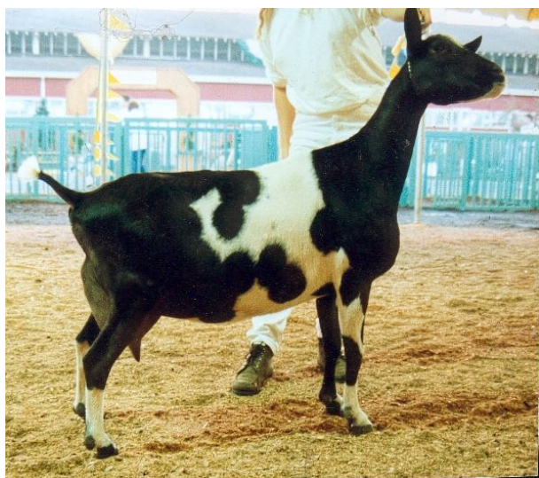
GCH Tempo Aquila Free Spirit *M 5/86-3/99 (dam)

Now, going even further back, before there was Freelance, there was Free Radical. Macaroon was a daughter of GCH++*B Tempo Aquila Free Radical, as was 2006 National Champion SGCH Cherry Glen Radical Gesture. Free Spirit was the only Alpine I retained while I was in college. She was a daughter of GCH++*B Redwood Hills Sunshine Reverie. Bred AI to GCH ++*B Tempo Aquila Amor, she produced Free Love. Radical was a son of Free Love, bred back to her grandsire, Reverie. Through a different daughter bred to +*B Shahena'ko Crown Royal, Free Spirit was the foundation of our original American Alpine doe line, which resulted in Free Thinker, Freely Imagined, Freelance, and Finally Free. In addition to her son Radical, Free Love's daughters included GCH Free Breeding, who is the dam line which produced Living Free.