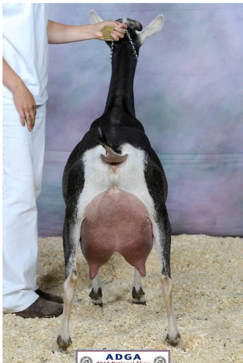
Rima rear udder Best udder '12 Nationals