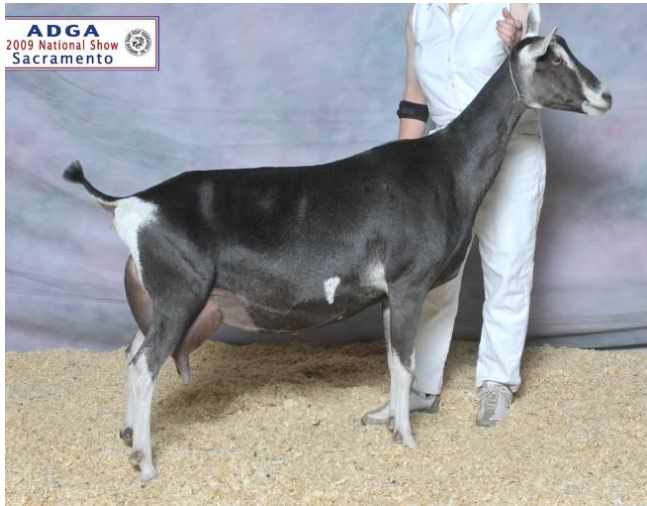
SGCH TEMPO AQUILA XOCATI 6*M 5-5 FS92 EEEE 4xGCH, 3xBQB. 2xRSGCH 2-00 305 4023 138 3.5% 115 2.9% '09 Top Ten '10 District 7 Alpine Specialty GCH