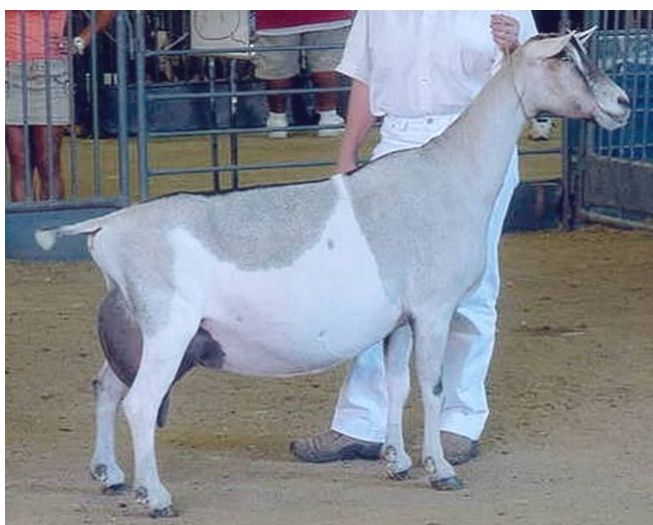
GCH TEMPO AQUILA PRALINE 4*M

2003 Nationals 1 st Dam & Daughter w/ Praline